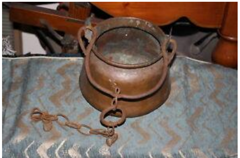
Figure 1 Ancient Middle Eastern Cooking Pot

4 Put into it the pieces of meat, all the choice pieces—the leg and the shoulder. Fill it with the best of these bones; 5 take the pick of the flock. Pile wood beneath it for the bones; bring it to a boil and cook the bones in it.