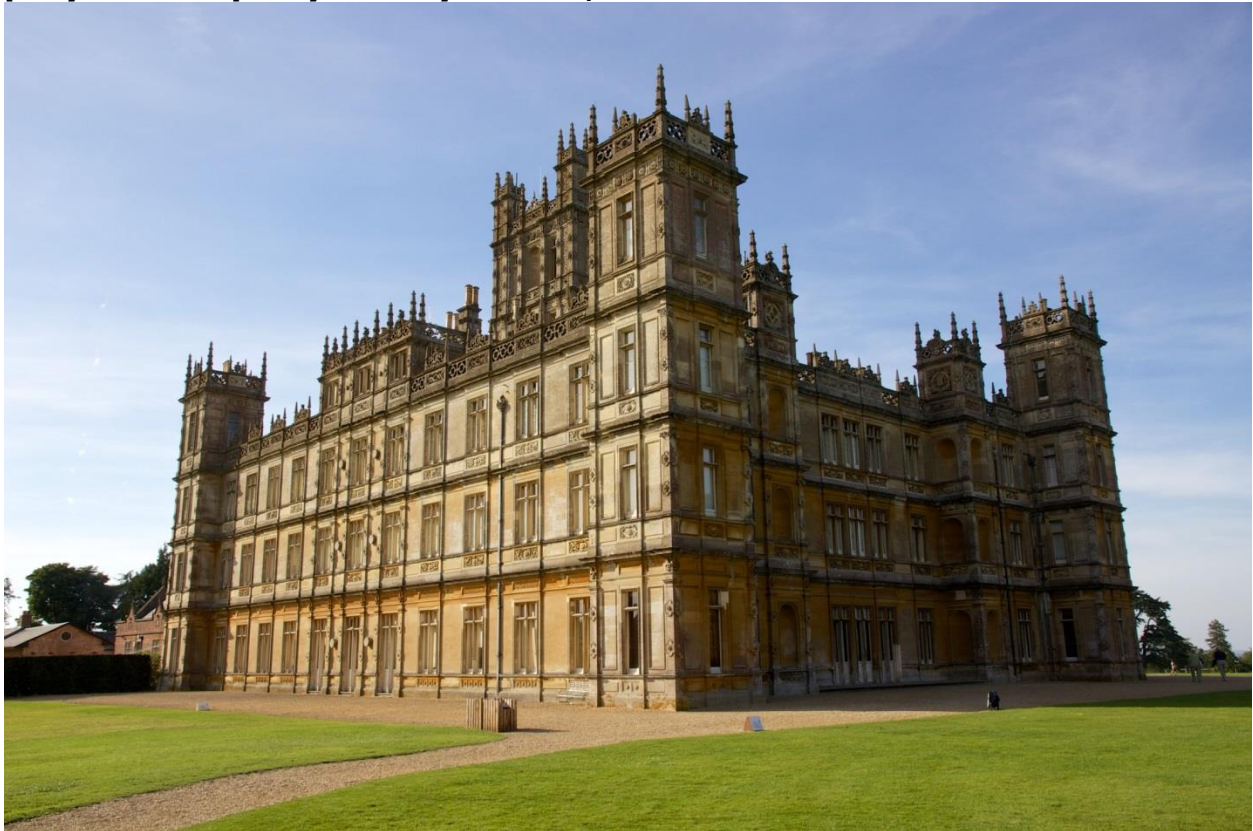
Figure 2 Highclere Castle Home of "Downton Abbey"

Note: Would you find this embarrassing? Today, it's unsophisticated to be overtly religious or responsive to the Lord. You get type cast in a negative way. It's like Maggie Smith's character Lady Violet says in a scene in Downton Abbey about Isobel's idealism: "Ideals are like prayers at a party. Always noble, but awkward."