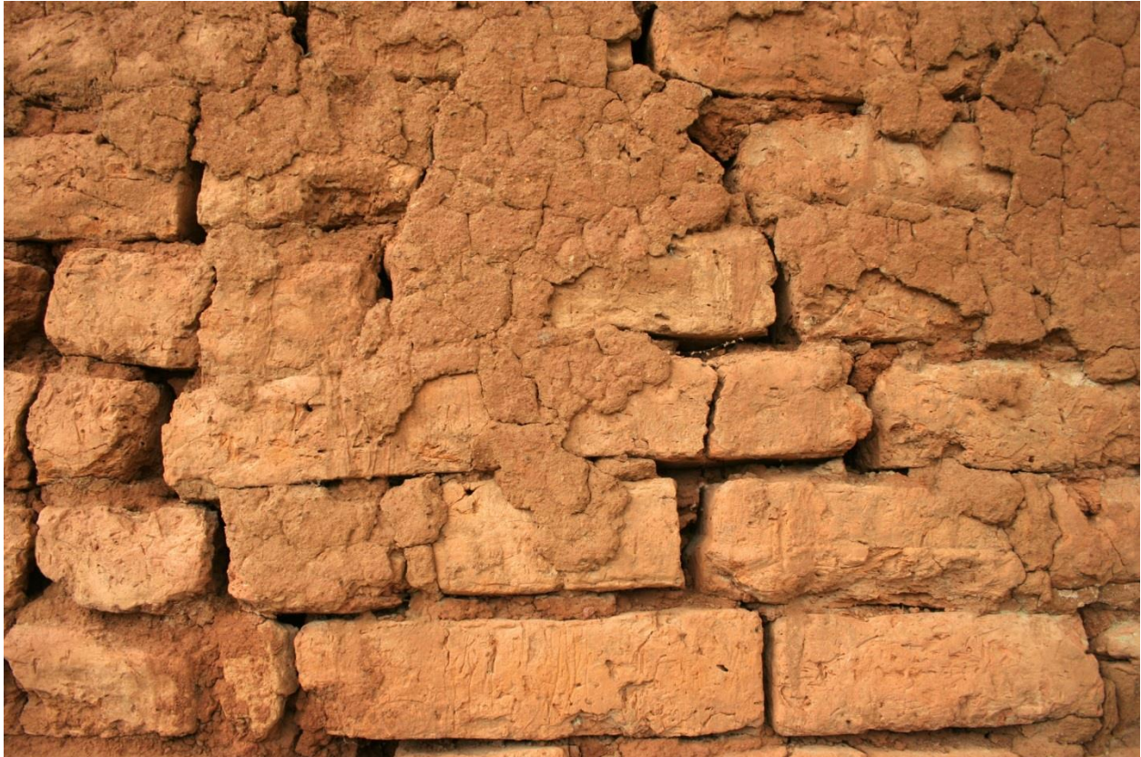
Figure 1 Historic Sundried Brick Wall Trojan

Note: When I was listening to this, I couldn't figure it out. But as it turns out, NIV study bible says it was not the city wall he was to dig through, but the sun dried brick wall of his house.