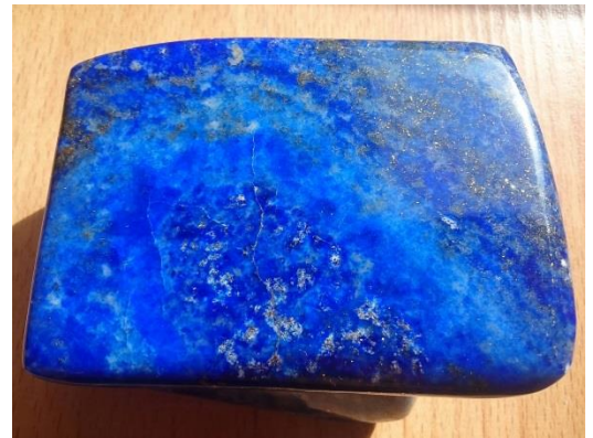
Figure 1 lapis lazuli dreamstime_m_88329462 ID 88329462 © Su.Fi. Sa. Dreamstime.com

as far as gems and dyes go. Only the wealthy could afford it for their garments. Kings and queens sought it and used it as a sign of authority and power.