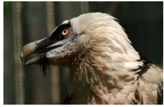
EPhoto 5///021

The NIV says "eagle" can also mean "vulture." They see it as referring Assyria, who had its eye on the land of Israel.