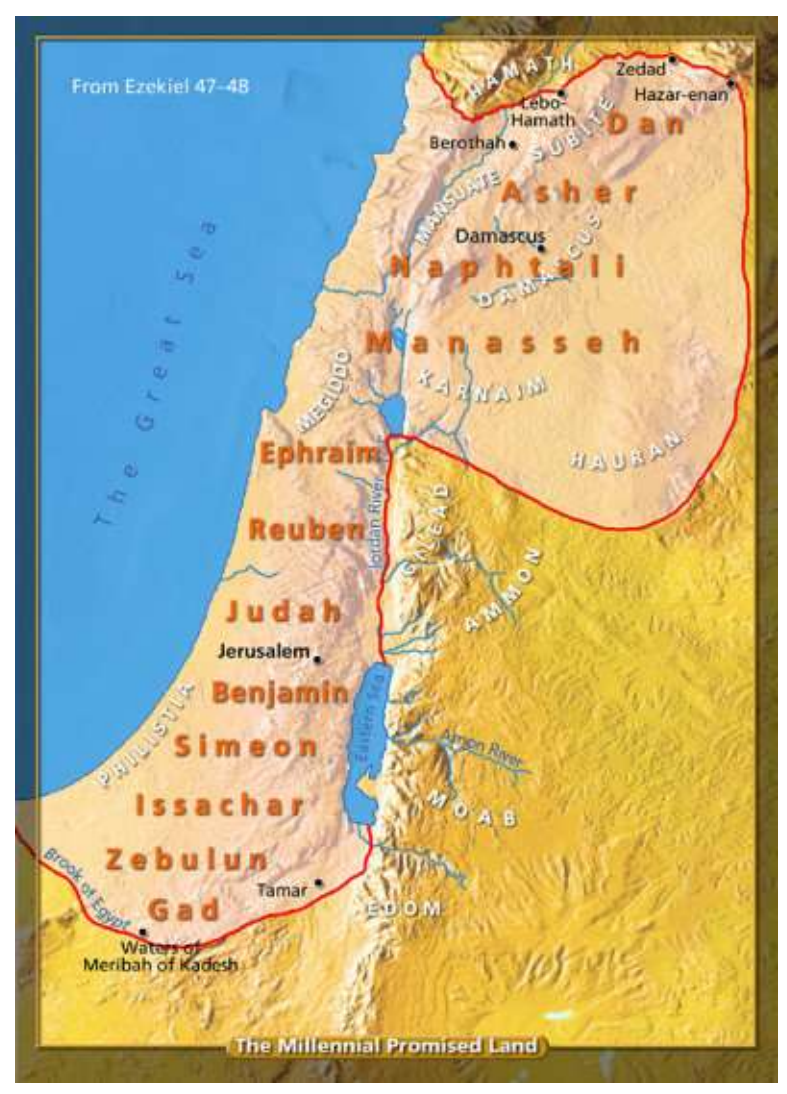
Figure 1map. http://bible.ucg.org/bible-readingprogram/imagesbrp/ezekiel/ez47promisedlandL.jpg