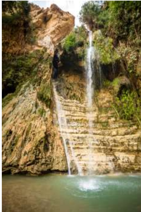
Figure 1 En Gedi dreamstime_m_66817044

NIV study Bible says “En Gedi” means the “spring of the goat.” It is a strong spring on the western side of the dead Sea. It was actually an oasis, watered by this strong spring.